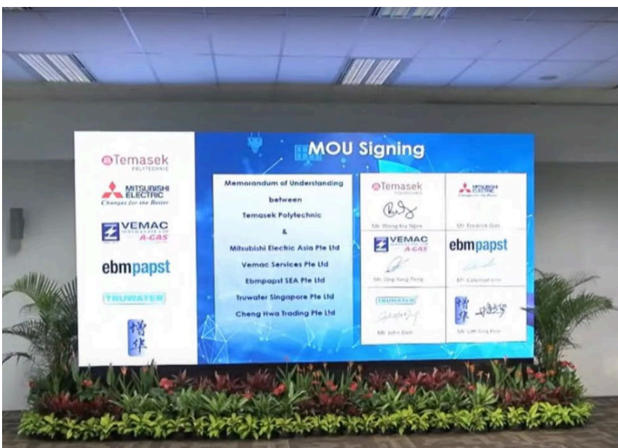
Fig. 2: Contactless MOU signing with industry partners