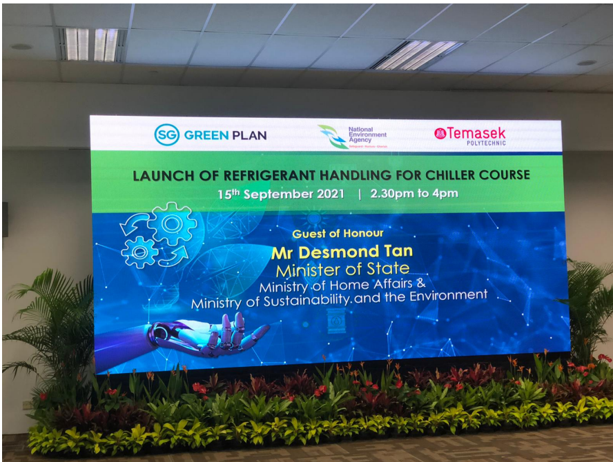
Fig. 1: Launch of “TP-NEA Refrigerant Handling for Chiller” course